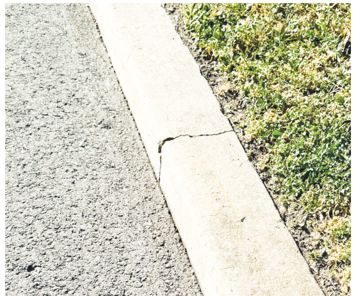
This curb is well maintained and allows easy water to easily run off. Plus, it looks great!