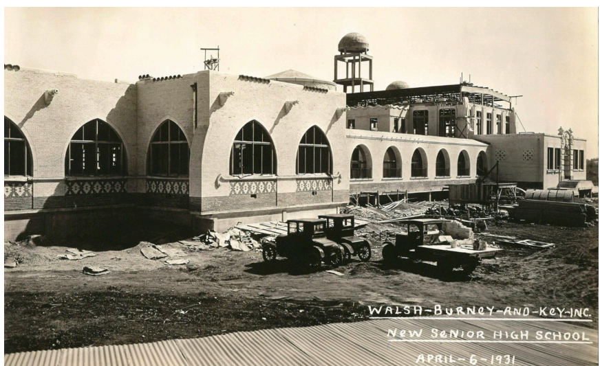
This 1931 view of the "New High School" under construction shows the skeleton for the concrete-reinforced dome.