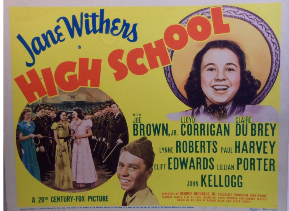
Lobby card from High School, released January 23, 1940

Jefferson eventually was San Antonio's top-rated high school, graduating many notable alumni, and its historical design and architectural beauty have remained sources of pride for generations.