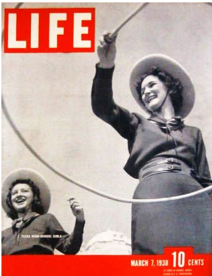
Jefferson Lassos drill team was featured on the cover of Life in 1938.