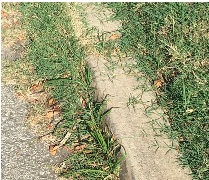
This curb is not properly maintained. Roots will weaken the structure and water will pond.

DO keep your curb clean so water flows and doesn't pond.