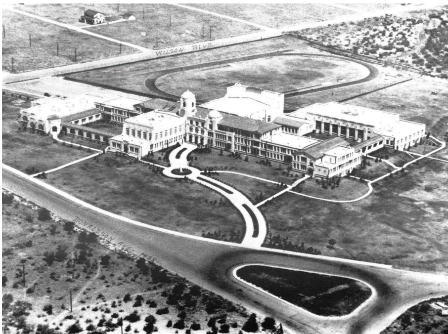
Aerial view of Thomas Jefferson High School campus soon after completion, showing the empty tracts surrounding the school. Ten years later, this would be fully developed.