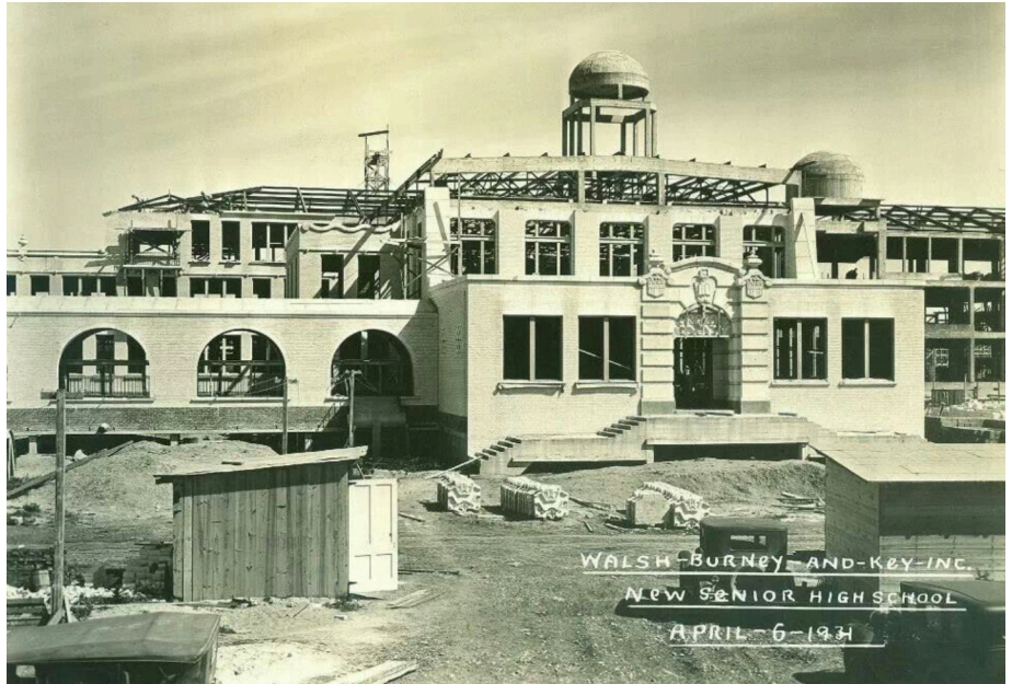
The yet-to-be-named "New High School," under construction in 1931.

Julian Castro, Class of 1992 San Antonio Mayor