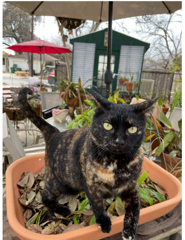
Willow Sanchez does her part to assist in the restoration of the family garden

Editorial Note: We are so very grateful for our neighbors and the way we all looked out for each other during the challenging weather conditions and power outages. As spring arrives, let us continue to find ways to assist one another as members of the Monticello Park neighborhood family and friends.