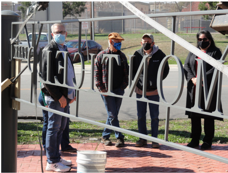
Dedicated neighbors gather for the dedication of Monticello Park's new park sign

construction contractor, and the engineering design contractor, met with MPNA board representatives to conduct a walkthrough of the 100-500 blocks of Furr. We met with residents, some pleased with the work and others airing concerns, to determine what items remained incomplete and/or had been overlooked. Questions still remain regarding the lack of clear communication between the City's project staff and residents and we continue to hold Public Works accountable for all remaining quality concerns. We anticipate an updated timeframe for project completion in the coming days.