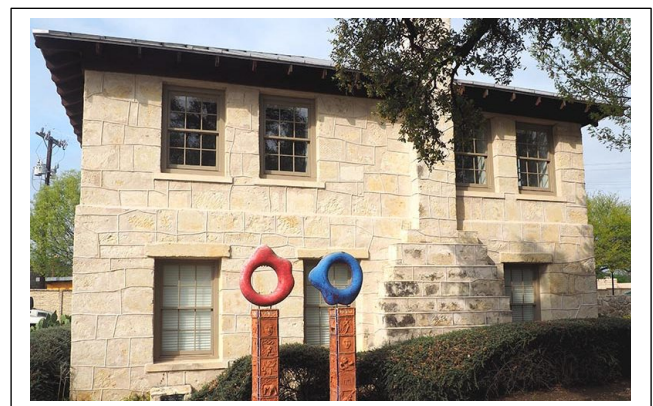
Bihl Haus Art, a beautifully restored space within the grounds of the Primrose Apartments