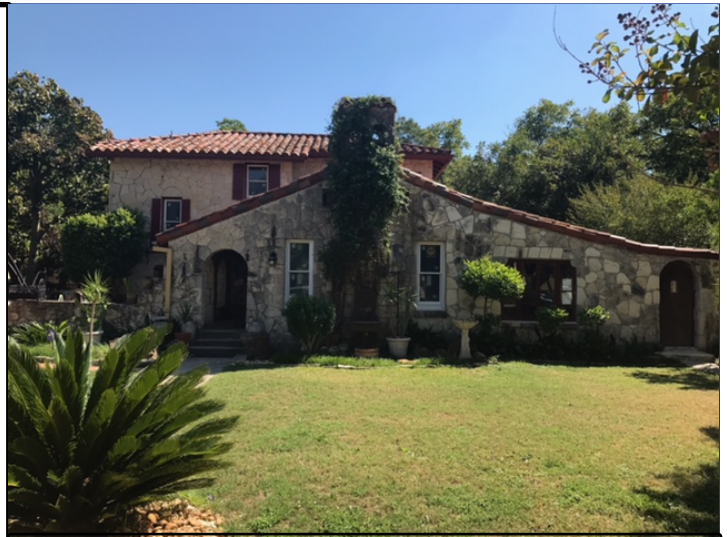
The Lerma House