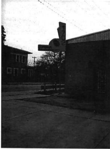
Brown Coffee Company on Kings Highway